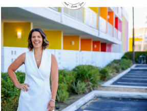
THE HMS PLAYBOOK